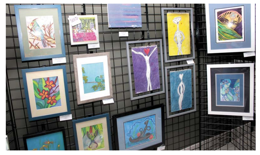
Lovely artwork was displayed at The Bungalow Hotel which is located in Pier Village, close to the Shore House club house. The club house is currently under renovation thanks to a generous grant the charity received at the end of 2022 from Impact 100 Jersey Coast.