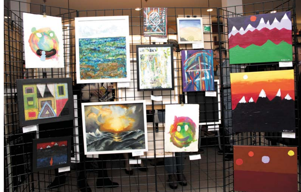
More lovely artwork by Shore House members and local artists.